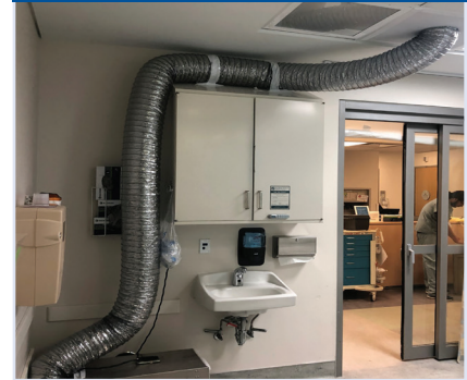
PHOTO 2 Don't use the existing return air duct system for exhaust (Lesson 6).