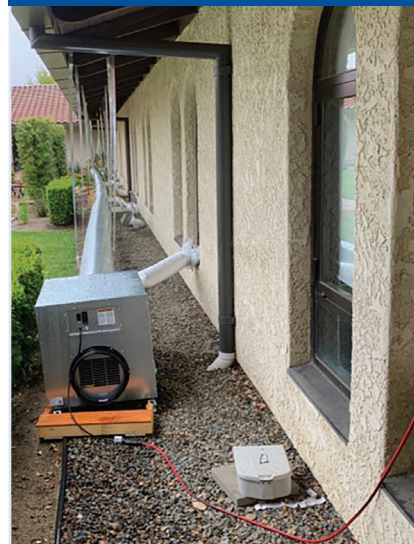
PHOTO 1 Place noisy, portable HEPA exhaust fan units outside, whenever possible (Lesson 2).

dB(A) to 35 dB(A) for patient rooms. Higher sound levels in patient rooms interfere with the healing process and activities of hospital staff.