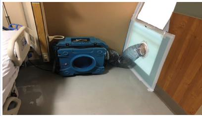
FIGURE 1 Conversion of a typical medical-surgical patient room to a temporary negative pressure patient room. (Left) A typical medical-surgical patient room may be quickly converted to a negative pressure room by placing portable HEPA exhaust fan units that are exhausted through windows directly by or via flexible duct through a fixed window panel. (Center) In this case, the return air grille is sealed. (Right) A digital pressure gage with audible alarm is placed outside the door.